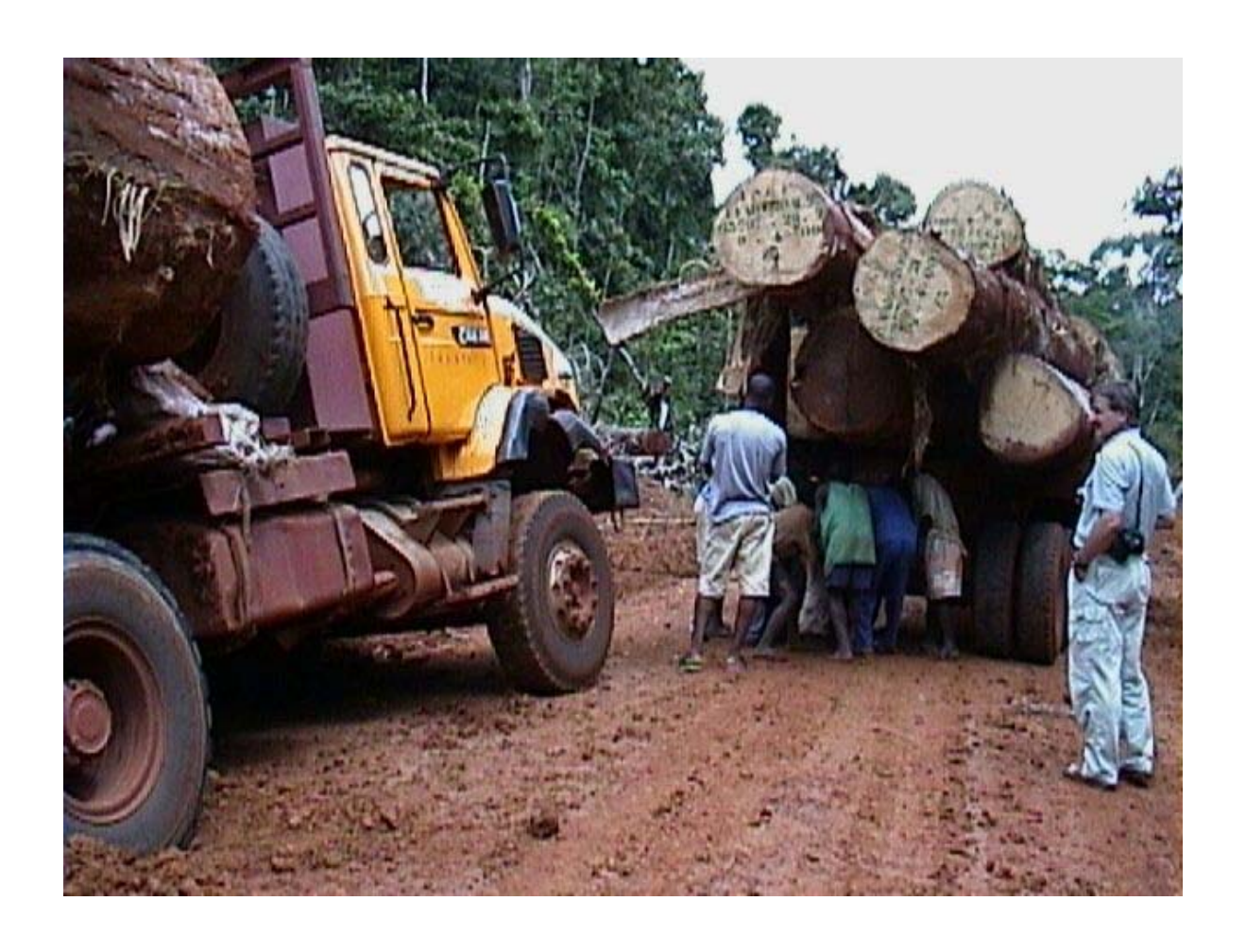
WPF Advisory Director: Karl Ammann

4. <u>Wildlife Protection Audits</u> - WPF is stepping up efforts to hold conservators and exploiters accountable for protecting wildlife in great ape habitat. Past failures in this arena stem from lack of transparency in conservation & development work. In November Discovery Canada will release a one hour TV documentary that features the work of WPF and its partners to expose and resolve the bushmeat crisis in central Africa. A photo essay book depicting the destruction of African wildlife by logging and bushmeat commerce will be produced next year for public sale. WPF is attempting to organize an independent investigations unit to audit wildlife protection efforts of local communities, law enforcers, NGOs, and government agencies operating in the Congo basin.